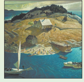
Celebrate the Art of Storytelling & N. C. Wyeth Page 8